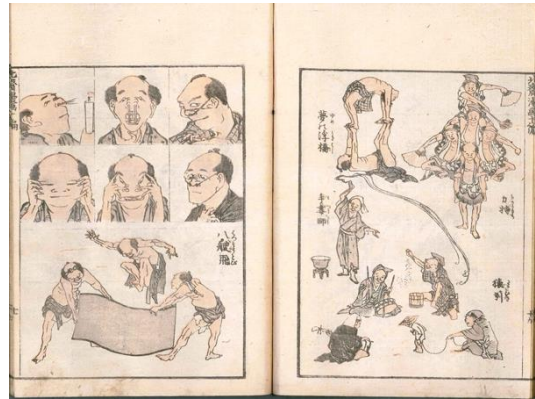
Katsushika Hokusai Sketches by Hokusai Vol. 10