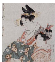
Katsushika Hokusai 「花魁と禿國」 (a part of the picture) ※Work will be displayed

In the changing of painting style, Hokusai had established a distinctive style “Bijin-ga” (a type of Ukiyo-e portraying beautiful women), which captured the trend and attracted many people. We introduce 100 art works including Bijin-ga depicted by Hokusai and his pupils and historical material for understanding the manners and customs of women in Edo period. Please enjoy gorgeous world captured by Hokusai’s delicate touch.