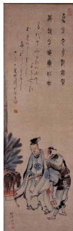
Katsushika Hokusai 「Manzai Performers」 (2 nd term) Collection:the Sumida Hokusai Museum