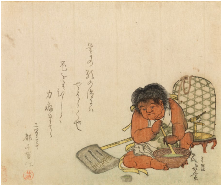
Katsushika Hokusai, Kintarō Feeding a Japanese Bush Warbler , The Sumida Hokusai Museum (1st term)

Find out "numbers" in the picture-calendar! The left picture is entitled Kintarō Feeding a Japanese Bush Warbler by Katsushika Hokusai. You can find a character of 小 meaning a short month in the ax at the side of Kintaro and also characters of "正、五、六、八、十、十一" meaning Jan, May, Jun, Aug, Oct, and Nov. Months of 1,5,6,8,10,11 in 1799 (Kansei 11) were short months. Therefore, it was likely that this was circulated in 1799.