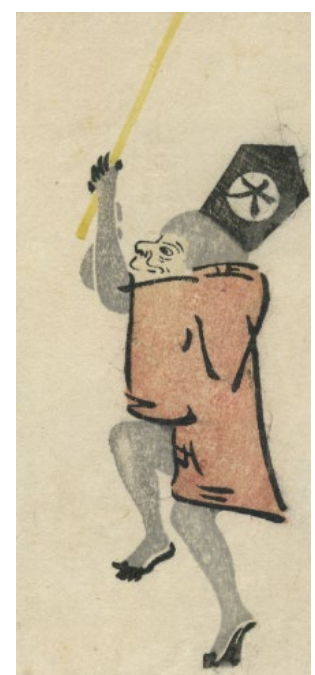
Painter unknown, Monkey , The Sumida Hokusai Museum (2nd term)

*The work will be replaced with different print of the same title during the period.