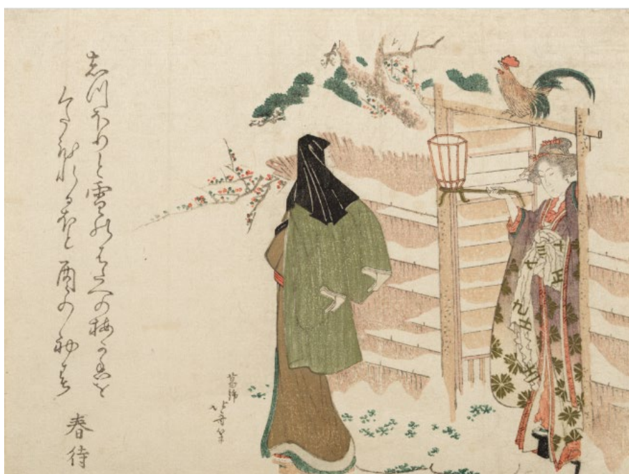
Katsushika Hokusai, Snowy Morning , The Sumida Hokusai Museum (all terms)

*The work will be replaced with different print of the same title during the period.